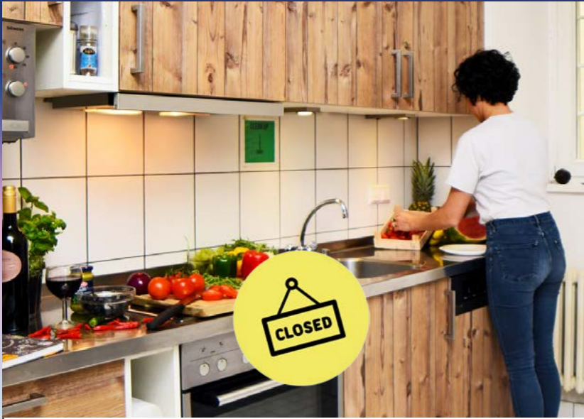
SELF-SERVICE KITCHEN AND PLAYROOM CLOSED